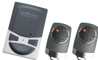
Wireless wall button and Two TrioCode™ 128 Remote Controls