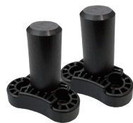
Adaptors for multiple sheet door drum types