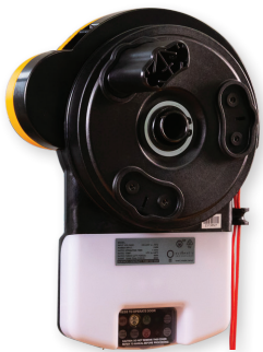
Opener with LED Courtesy Light